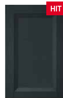
Giove grey pearl