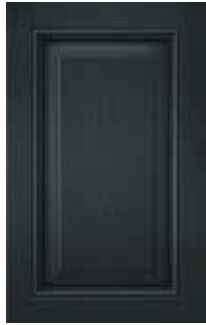
Sole grey pearl