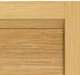
Facades with counter-profile (under an angle of 90°)