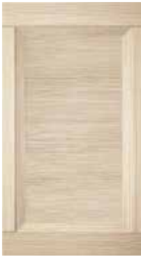
Giove light cappuccino