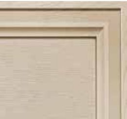
Facade under an angle of 45