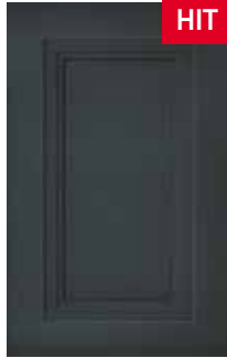
Scale grey pearl