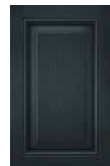
Sole grey pearl