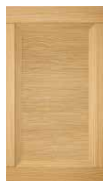
Giove light naturale