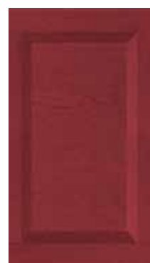
Giove light rosso