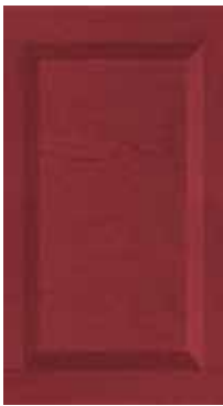
Giove light rosso