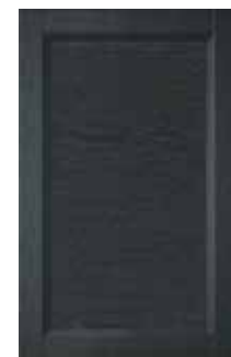
Diana grey pearl