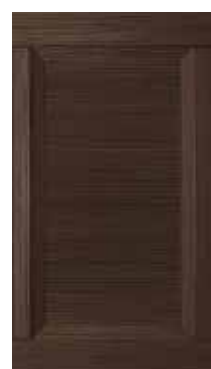
Giove light note