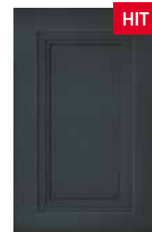
Scale grey pearl