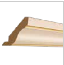
Rods with patina