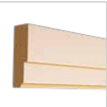
Lighting plank with patina