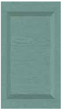
Giove light verde