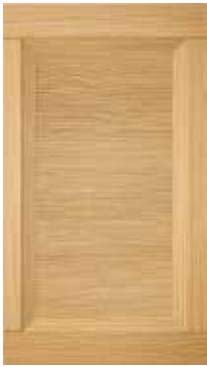
Giove light naturale