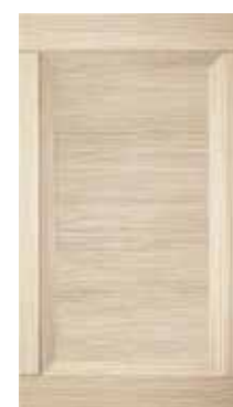
Giove light cappuccino