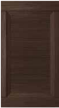
Giove light note