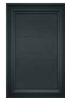
Gracia grey pearl