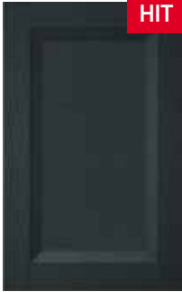
Giove grey pearl