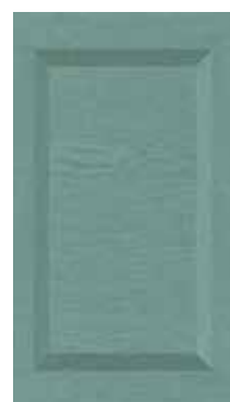
Giove light verde