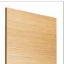
Finishing panel Thickness 16,18, 22 mm