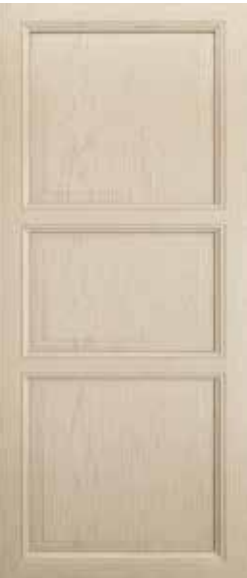
Facade with shaped edge panel and imposts