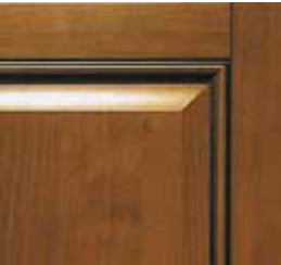
Facade with shaped edge panel