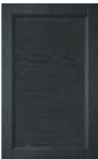
Diana grey pearl